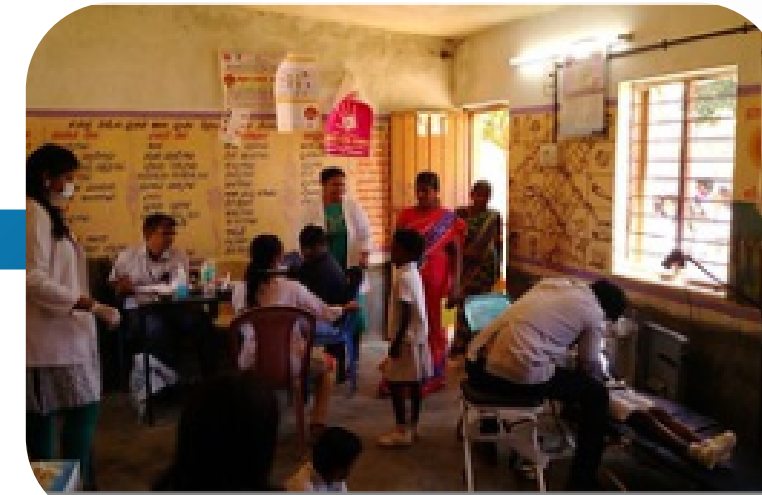
CSR & Social Impact Programs