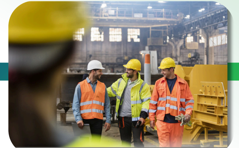
Health, Safety & Workforce Well-being